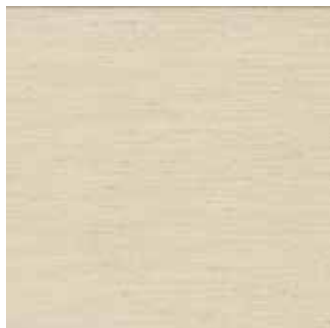
Maurice Kain INVENTA LINEN

The Parnell design & colours, have been chosen by our design team to complement these Maurice Kain & Sekers curtain fabrics: