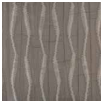
Sekers MOKY DIAMOND SMOKE