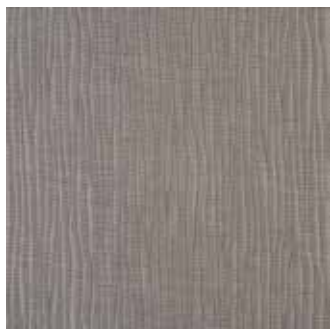
Sekers JOVE TAUPE