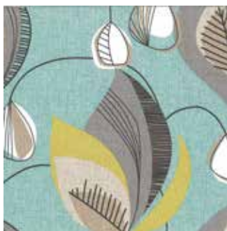
Maurice Kain STARLIGHT AQUA