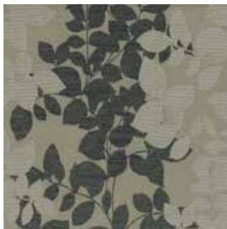
Maurice Kain PRAVADA VISION