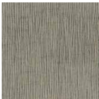
Maurice Kain LA MESA VISION